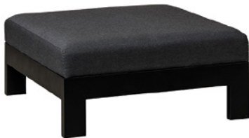
Ottoman W90 D90 H42