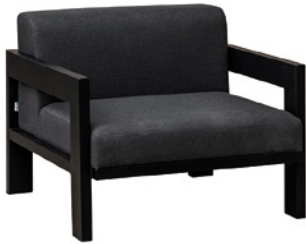
Single Sofa W90 D90 H74