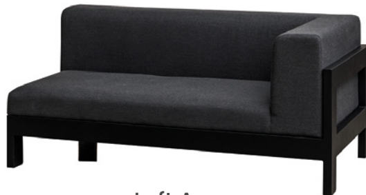
Left Arm W164 D90 H74