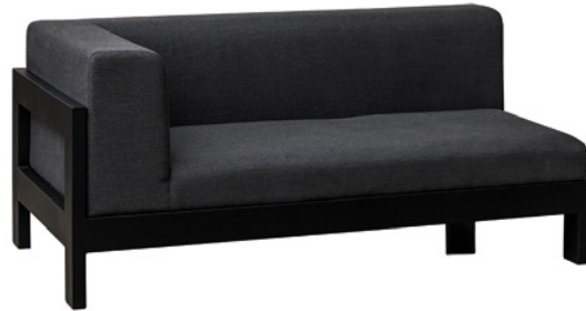
Right Arm W164 D90 H74